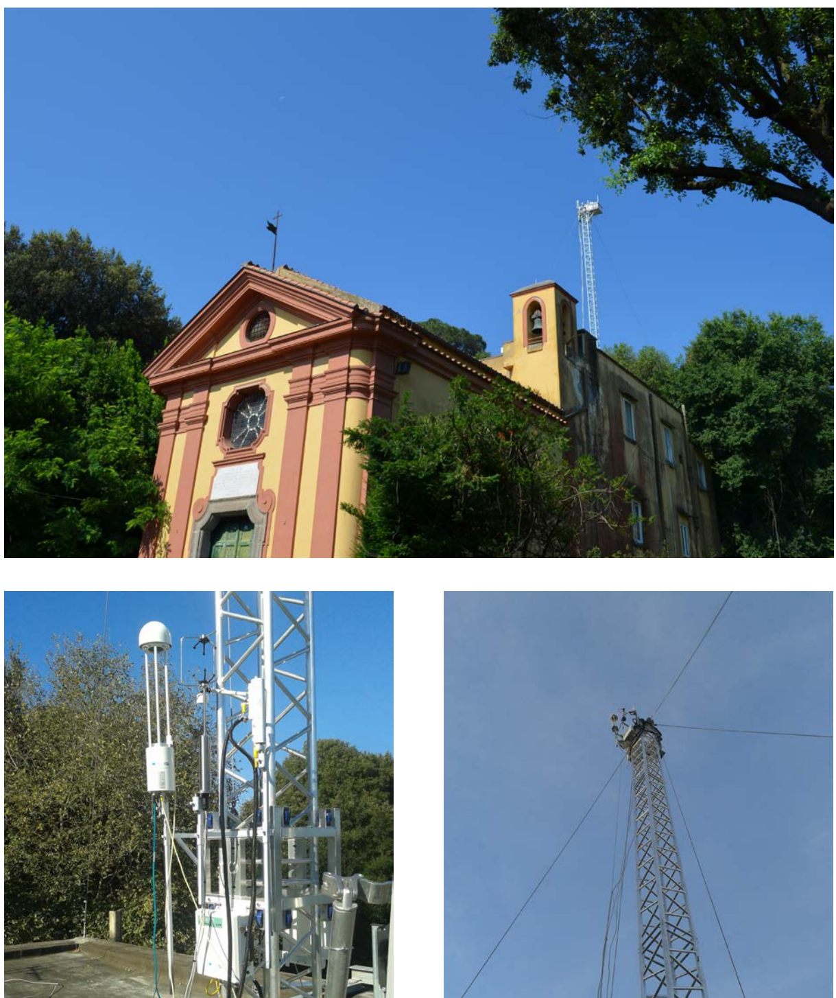
The EC tower was installed above the San Gennaro Church